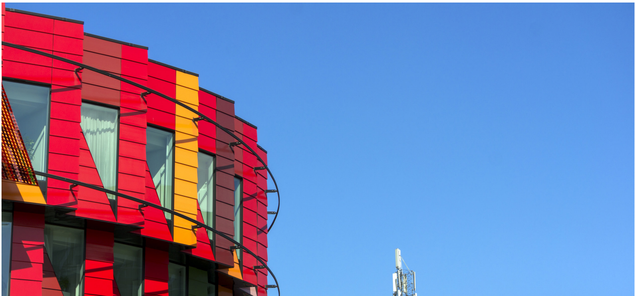
Lindholmen Science Park.