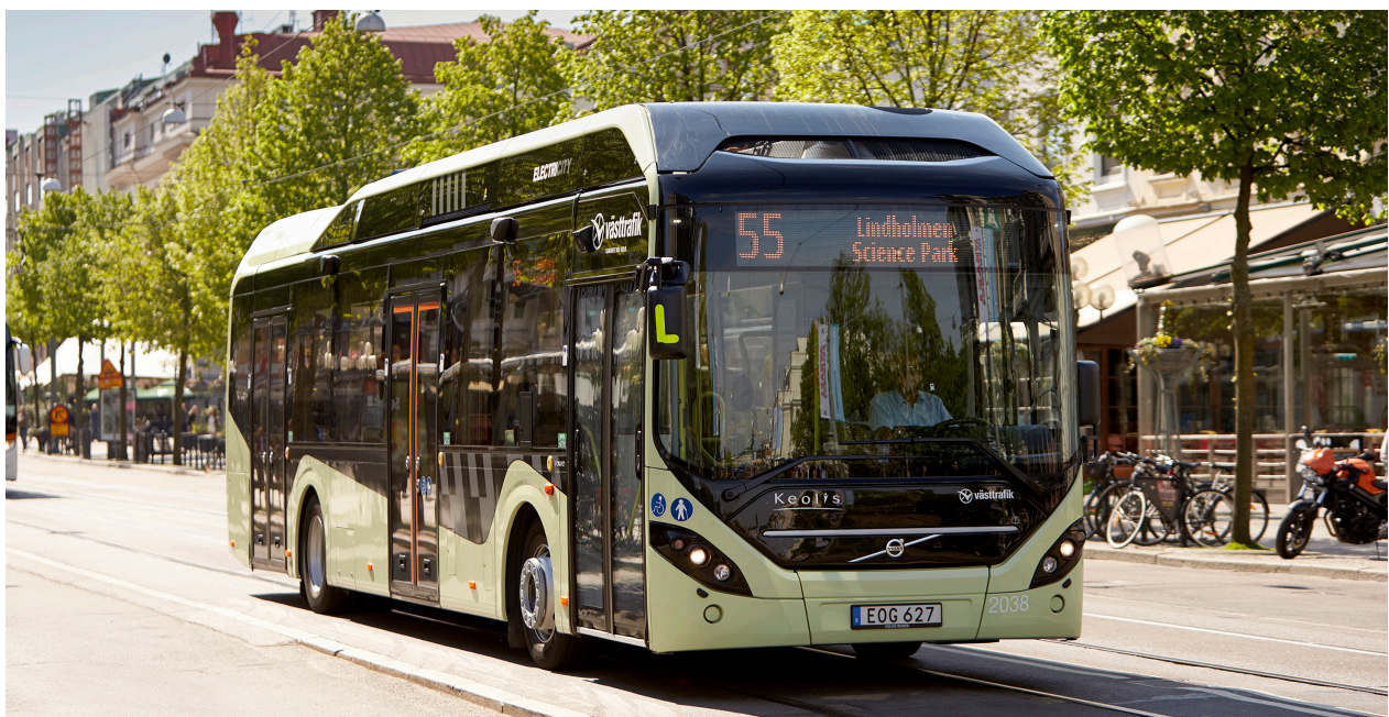
Electric bus in public transport.