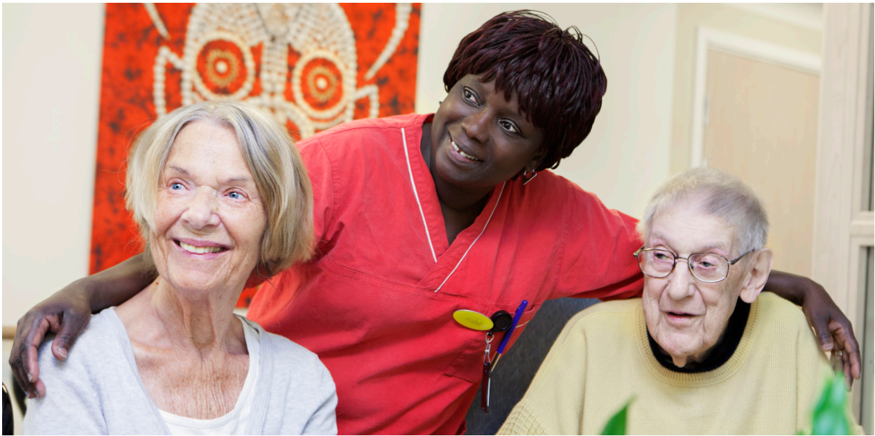
AllAgeHub in geriatric care.