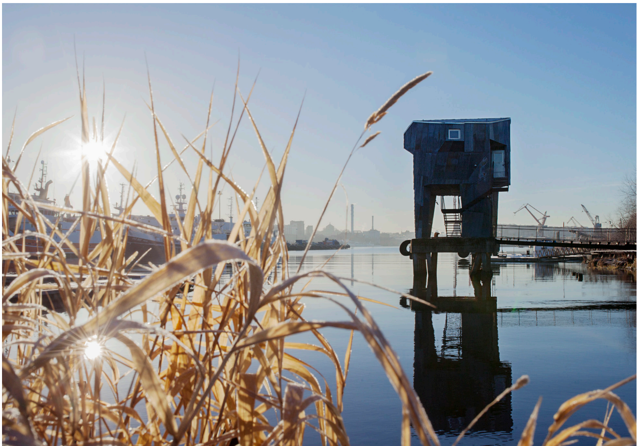
Public sauna in Jubileumsparken.

The Innovation Programme creates the appropriate conditions for the city's organisations, with over 50,000 employees, to carry out important innovation work for the benefit of residents, visitors and business.